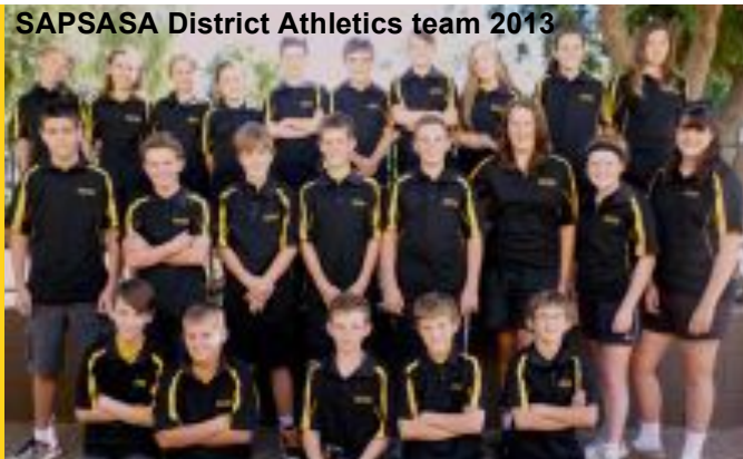
SAPSASA District Athletics team 2013

Teamwork Integrity Generosity of Spirit Excellence Respect