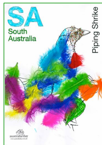
"Piping Shrike" by Archie Sullivan Close, Reception (NB. The Piping Shrike has been the official badge of the South Australian Government since 1901)