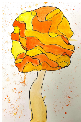
Artwork by Ruby - inspired by artist Paul Klee

Students have recently studied and learnt about trees in different styles by different artists. They then designed and created their own tree in their chosen artists' style. All artwork is proudly on display in the Upper Primary unit.