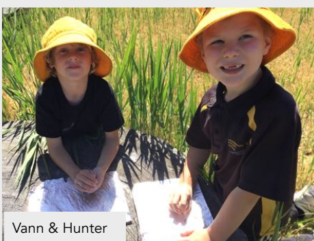
Vann &amp; Hunter