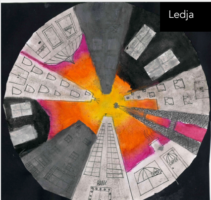
MP Black class - This is Me

At the commencement of the year, the students were given the task of designing a t-shirt all about themselves. They were asked to show many of their favourite things, for example food and school subject and also a self-portrait. The students were very creative and shared much about themselves in a visual manner.