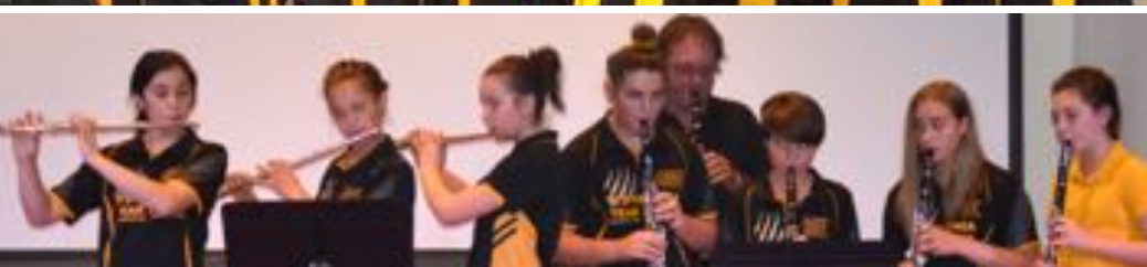
Instrumental Music Students