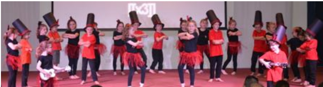
Junior Primary 'Rockin' Robin'