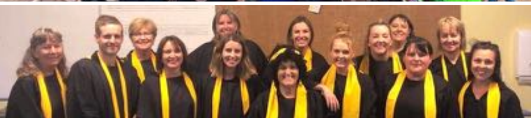
Staff Item 'Stan's By Me'