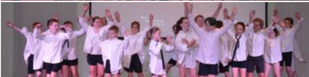
Lower Middle Primary 'Old Time Rock 'n' Roll