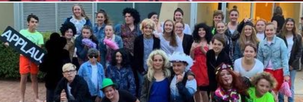
Upper Primary 'Cindy-rella and Johnnie Rock'