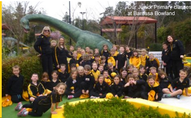
Our Junior Primary classes at Barossa Bowland

Teamwork Integrity Generosity of Spirit Excellence Respect