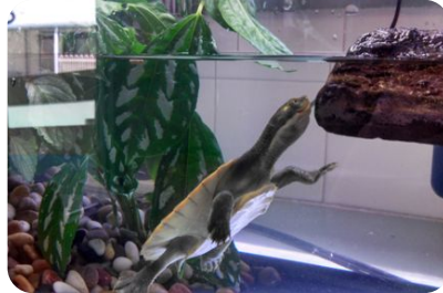
Meet Tiger: Reception student Lyam Marshall with Tiger